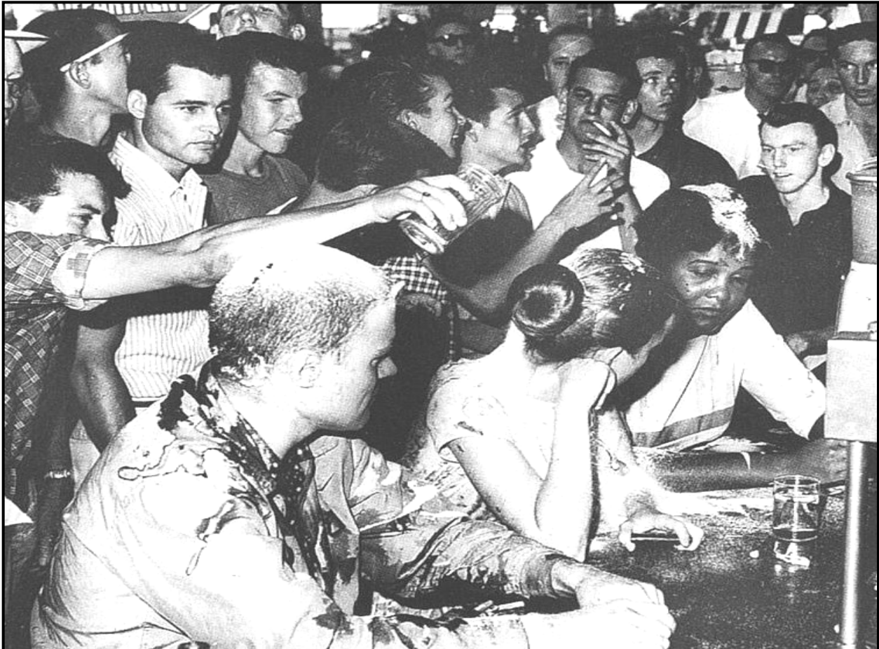
[From Parting the Waters: America in the King Years 1954–63 by T Branch]

The source below is a photograph taken from a book titled Parting the Waters: America in the King Years 1954–63 by T Branch. It shows three students participating in a sit-in at a lunch counter, in Jackson, Mississippi, on 28 May 1963. A member of the white group is pouring a liquid substance over a seated student.